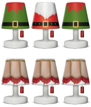
Lots of designs to choose from