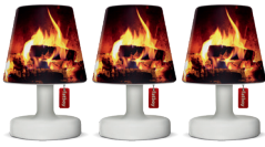
Mini cappie set